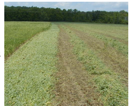
Narrow rows on right are ready to chop in 2-3 days. Wide swath on left in 2-3 hours.

Many of today's farms are mowing, without conditioning, directly to a swath greater than 80% of the cutter bar. The majority of the leaves and intact stems are in the sun. This allows PHOTOSYNTHETIC DRYING to remove moisture faster than any machine manipulation. Photosynthesis in sunlight converts carbon dioxide (CO 2 ) and the plant's water (H 2 O), into carbohydrates. The plant, even cut off, is still alive. If the leaves are in sunlight they continue to photosynthesize down to about 50% dry matter; removing water in the cut plant , while producing sugar and other highly digestible components – thus increasing feed quality as it simultaneously dries the forage . It commonly increases the energy reaching the cow's mouth 20% . The key bonus is that it will dry it faster than any machine handling . By not conditioning the stem, the leaves will wick the moisture out of the stem. Thus, the stem dries first and the leaves last. Mowing without conditioning results in a swath with leaves on the top in the sun to maximize photosynthesis, and the stems underneath. In a narrow windrow and/or if you leave it overnight,