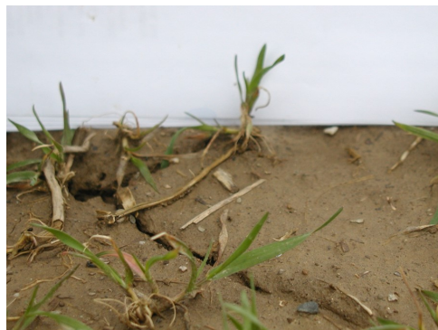
Shallow planting allows spring heaving to push the plants up so the roots dry and the plant dies. Picture below was planted correctly in the same field and had no heaving.