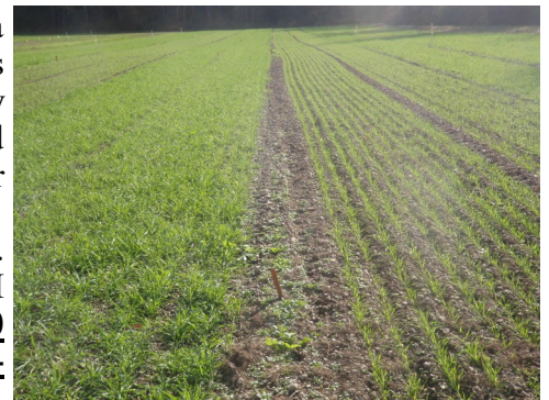
Early planted on left smothers weeds, resists spring heaving, yields more than later planted on the right. Both give high quality forage.

Earlier planting gives higher potential yield. The Best Management Practice we found in NYFVI supported research is to plant winter triticale forage 10 days to two weeks before your LOCAL wheat planting date. It is more critical as you go further north where winter comes swiftly. Early planting is critical to maximize tillering. The more tillers the more poten-