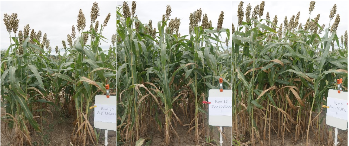
30 inch row @150,000 seeds/a (8.3 lbs./A) 15 inch row @150,000 seeds/a (8.3 lbs./A) 6 inch row @150,000 seeds/a (8.3 lbs./A)

seeds actually become mature plants – which complicates our effort to determine optimum populations in the Northeast. In the population study of row width and seed rate, narrow rows have a yield advantage over the standard corn 30 inch rows. In 2015 the 7.5-inch space was significantly higher yielding than the 15 or 30 inch. These results were the same as work completed in Texas. In the second planting July 8, 2016 , the 15 inch rows (often planted by a drill with every other hole plugged in order to achieve the low seeding rate of 8 pounds/acre suggested) came out significantly higher than the 6 inch rows. The bottom line: cover the ground as soon as possible to maximize yield from sunlight interception; out compete weeds by shading the ground quickly; prevent soil erosion and moisture loss.